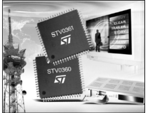
Figure 1. Package/ 64-pin TQFP